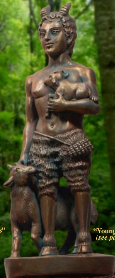
“Young Pan” (see page 2)

Many more items available on our website!