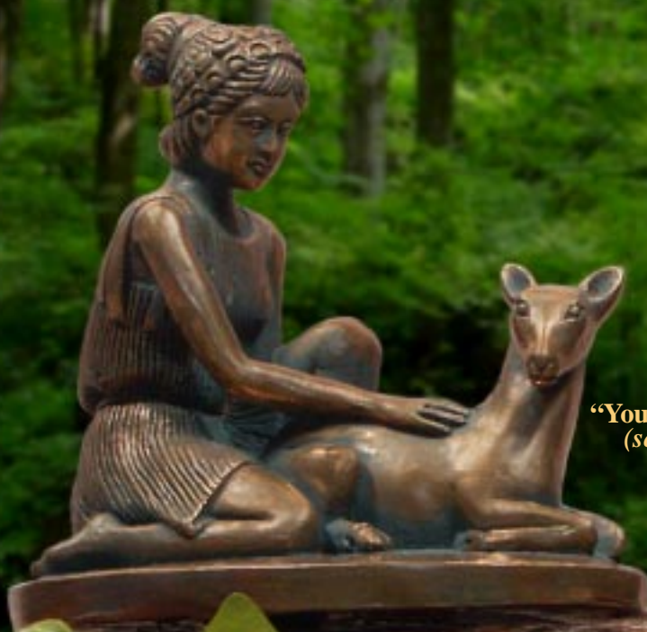
“Young Artemis” (see page 2)

Your source for sacred images since 1978.